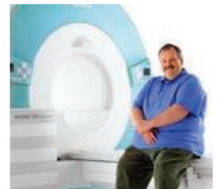
Table weight limit is 550lbs